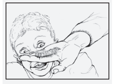
True education comes from parents.

Read Proverbs 1:8–19. What two different ways of "education" are given in these verses? What is the basic message for parents and everyone who fears the Lord?