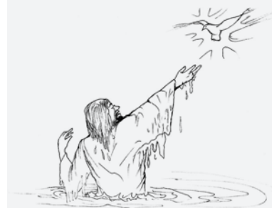
The Father honored Jesus as His Son at Jesus’ baptism.

Jesus was fully God and fully human. What does this amazing truth tell us about the close connection between heaven and earth? What comfort can we learn from this close connection?