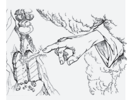
God personally engraved His requirements for a relationship with Israel on tablets of stone.