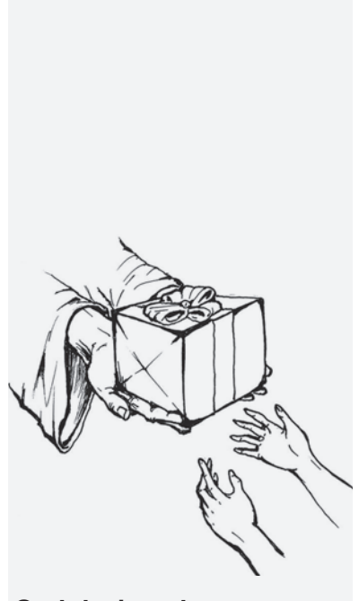
God desires that we accept His gift of eternal life to live with Him forever.

How much self are you willing to give up in order to reach others for Christ? How much self have you already given up in reaching out to others? How much of the "law of Christ" do you follow?