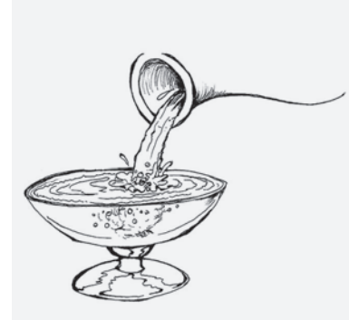
The word Jesus used for "fulfill" ( plero ), in Matthew 5:17, means "filling to the brim."