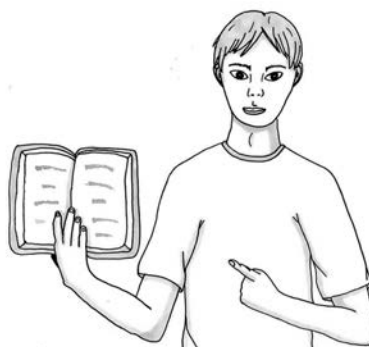
The keys of the kingdom of heaven are the words of Christ.

Jesus’ example speaks with great power here. If anyone ever had the right to withhold authority and give commands, Christ certainly did. Instead, Jesus filled others with authority. He then commanded them to work outside of His presence. His influence was His instruction and the examples of His life. He taught His disciples in this way, and He sent them to minister (work for God) and witness.