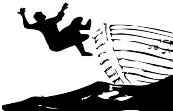
Jonah urges the seamen to throw him into the sea.

We cannot fully understand many of the wonders of the world around us. This is especially true when they are beyond the reach of our senses and even our understanding. How does the Creator speak to you through what He has made?