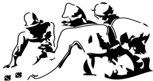
The lot falls on Jonah.

a great respect for the Lord to whom they also pray. They are also kind-hearted toward the Lord's servant, Jonah. This is why they go out of their way to try to row back to the land. But finally, they agree with Jonah that he should be thrown overboard. With this done, the storm stops, and the seamen make a sacrifice to the Lord and praise Him.