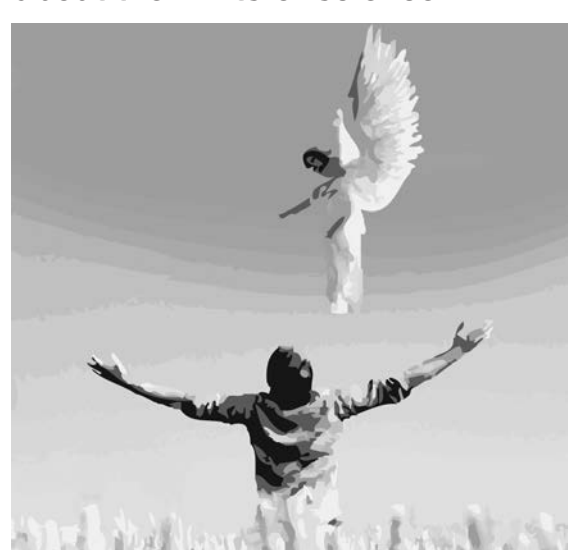
The promise of the return to life gives hope for the Christian.