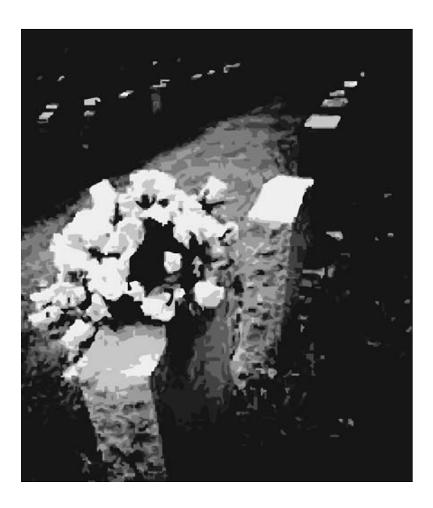
One of the best promises of the earth made new is that death and suffering will be forever gone.

Why are these promises of a new life so important to us? What would our faith be without them?