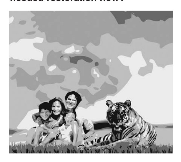
The promise of the return to life gives hope for the Christian.

As we can understand, the gospel is so much about restoration. God alone can do the final restoration. But what choices can we make that can help to bring about some needed restoration now?