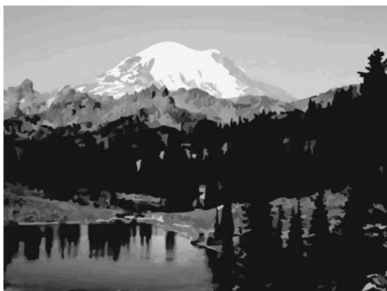
All creation depends on the Creator for life.

The Psalms are full of praise for the Creator. Sometimes this is shown in nearly the same language in Genesis 1. At other times the language is more general. But in all cases, the description of Creation is nearly the same as in Genesis 1. These descriptions also remind us how Genesis helps us to better understand our beginnings as sons and daughters of God.