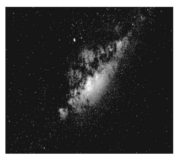
The universe was created by the power of God's word.

Why is the Creator God the only possible reason for the Creation? Bring your answer to class on Sabbath.