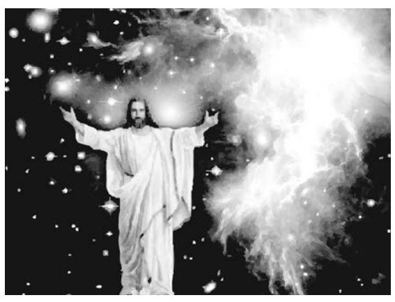
Jesus, the Logos, or Word, is the One who created all things.

How would you answer if someone were to ask you, "What is your God like?" What proof could you give for your answer?