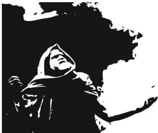
The law on Sinai was given through angels and Moses.

Think about some of the other experiences people in the Bible had with God—Adam and Eve in Eden (Genesis 3); Jacob’s ladder (Genesis 28); and Paul on the road to Damascus (Acts 9). Maybe you have not experienced anything as wonderful. But in what ways has God shown Himself to you? Ask yourself, too, whether anything in your personal life might prevent you from having the kind of closeness that Abraham experienced with God. If so, what steps can you take to change this?