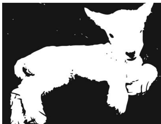
The ceremonial laws pointed to our need of a Savior.