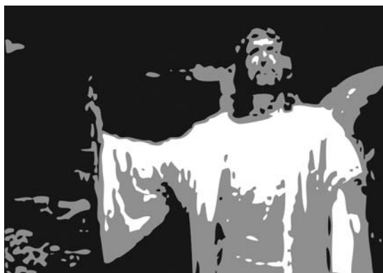
Stephen preached that Jesus, the risen Savior, was the true center of the Jewish faith.

Saul believed that he was right. So he was willing to put those "false" believers to death. Like Saul, we need to work hard for what we believe. But why must we be careful to learn to use good judgment? What could happen if we are wrong about what we believe to be true?