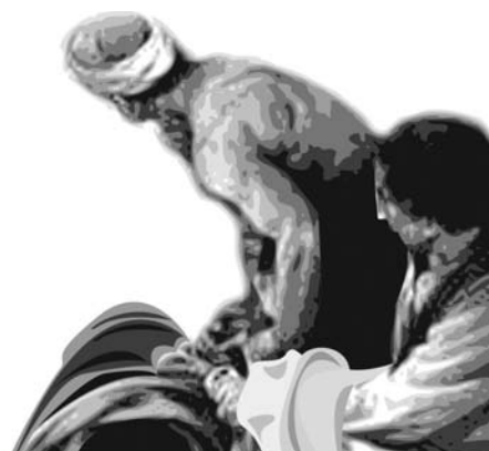
Paul held the coats of Stephen's killers.

To human minds, Saul's conversion must have seemed impossible. This may explain why many people doubted and refused to believe it when they first heard about it.