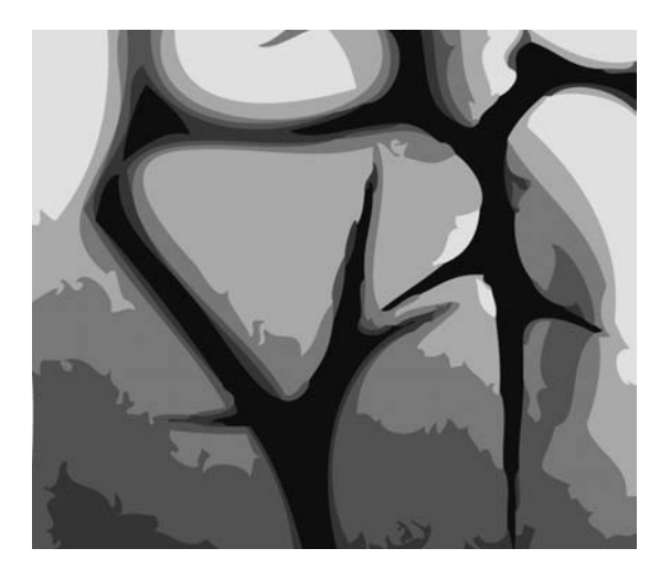
After the Fall, the ground was cursed with thorns and thistles.

Look around at the wonders of nature where you are. What parts of the original creation seem to remain? What hope can you draw from those parts that point you to the promises of a better world?