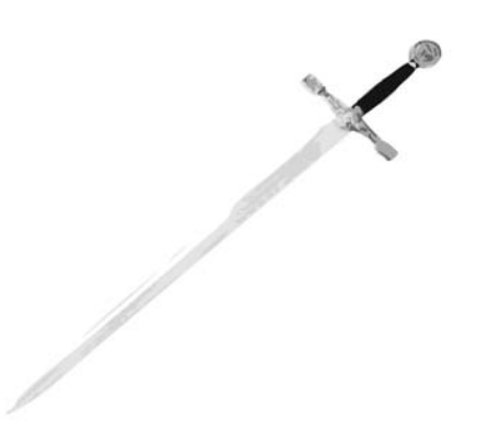
Whatever beauty we find in nature today is a double-edged sword—beauty and marvel are there, and so are earthquakes and diseases.

Read over Genesis 3, the Fall. What changes came to both humans and nature as a result of sin?