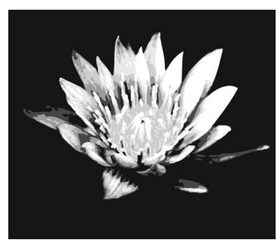
When all else fails, the beauty of nature points to God and gives us great comfort and hope.

Suppose you are telling someone about God's goodness as shown in nature. And the person brings up the question of tsunamis,<sup>9</sup> earthquakes, famines, and other terrible events. How would you answer? What do terrible events tell us about the limits of what nature can teach us about God?