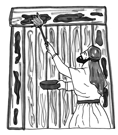
Just as the blood on the doorposts protected the people of Israel, so the blood of Jesus protects the one who is justified.

When the people of Israel put blood on their doorposts the night before they left Egypt, it protected their first-born children from the killing that happened to the firstborn Egyptian children. In the same way the blood of Jesus Christ protects the person who has been justified. And those who hold on to Christ will be protected when God's wrath finally destroys sin at the end of the age.