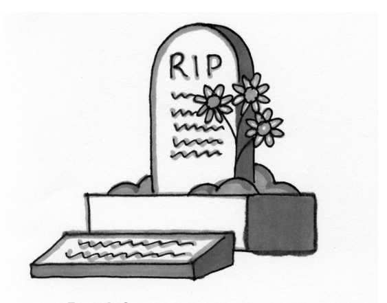
Death is our greatest enemy.

verse for purposes other than Paul planned."—Adapted, volume 6, page 529.