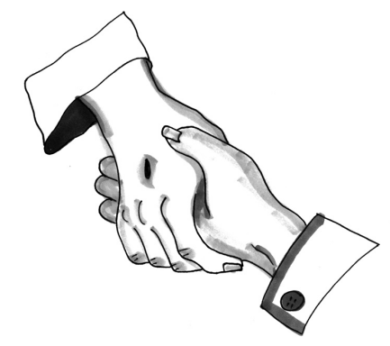
As long as we hold on to Jesus in faith, we have everything to hope for.

What is the one thing in your life that you hope for more than anything else? How can that hope be fulfilled in Jesus? Or can it? If not, are you sure you want to be putting so much hope in it?