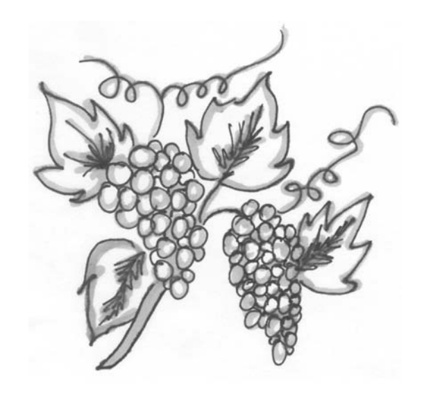
A branch cannot bear fruit if it is not connected to the vine.

Picture a branch that has fallen off an apple tree. Suppose that branch had several apples that were just becoming ripe. What soon happens to the branch? To the apples? Would it make any difference if we painted the apples a deep red? Suppose we watered the branch or put fertilizer (plant food) on the ground around it? Would the branch grow more apples if we stuck the stem into the ground? Why is being connected to the trunk (the vine) important to the branch?