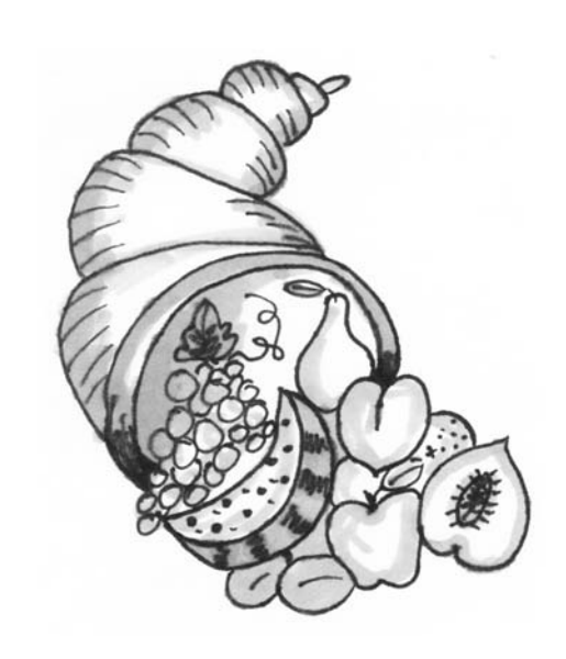
The result of abiding in Jesus will be that we will grow much fruit.

need to be careful about what our purposes are. What is our greatest goal in this kind of work? Is it to glorify<sup>7</sup> self or to glorify God? How can we learn to make a difference between the two? In many ways, it can be easy to mix these things, covering even the most selfish actions under the false front of "glorifying" God.