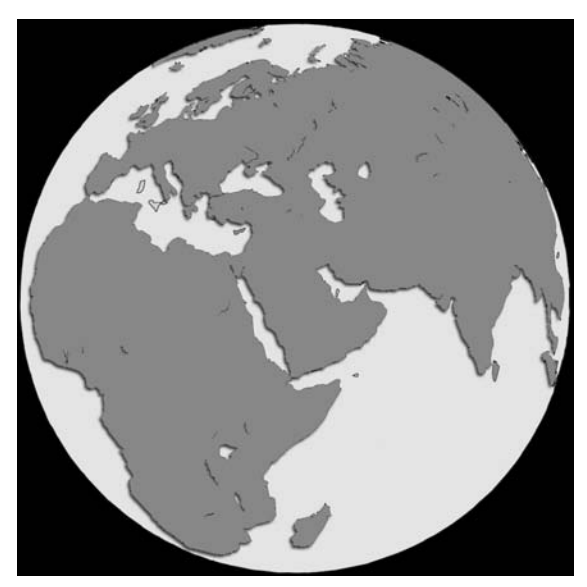
We are commanded to take the gospel to the entire world.

The gospel is to be preached "to all nations." According to General Conference figures, the Seventh-day Adventist Church is now preaching its message in more than 200 countries. This means that there are only a few countries where our church is not there. Among these are several large ones: North Korea, Saudi Arabia, Syria, and Yemen. Most of the others are small, with less than one million people. So, one would be tempted to conclude that the Adventist Church almost has "finished the work." But that would be false. We must give thanks to our Lord that our church continues to grow fast in many parts of the world and that many new places are being entered. But the