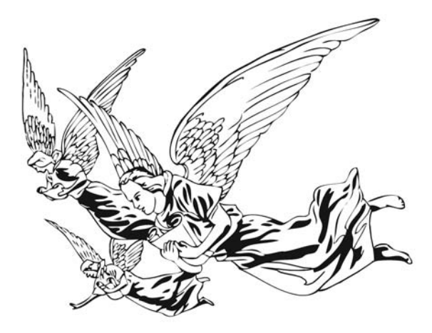
The three angels represent church members who warn the world to get ready for Jesus' return.

The verses about the messages of the three angels is found in a theme (idea; topic) that focuses on the end of time. It starts with a vision of the "firstfruits" (verse 4) of saved people. Then a vision of the "harvest" of all saved people follows (verse 15). It is important to know what these messages include. But also we need to understand who these "angels" who bring this "eternal gospel" (verse 6, NIV) are. The word angel in prophecy is a symbol for human4 messengers, leaders, and church members. Ellen G. White supports this view: "The angels are represented as flying in the midst of heaven. They are preaching a message of warning to the people living in the last days of this earth's history. No one hears the voice of these angels. for they are a symbol to represent the people of God who are working with heaven. Men and women are given light by the Spirit of God, and sanctified [made holy] through the truth. They preach the three messages in their order."-Adapted from Life Sketches, page 429.