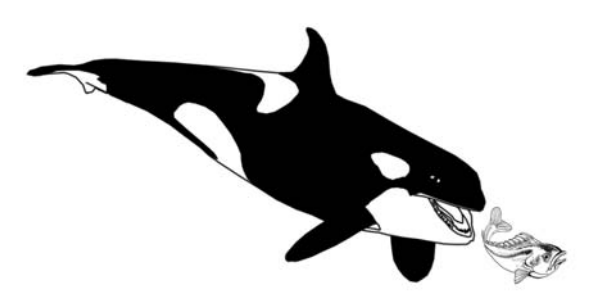
Because of sin, nature does not always show us God's love.

do you find there that bother you, and why? What do your answers tell you about how limited nature is in making known to us the fullness of God's love and who He is?