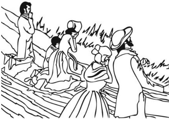
The believers wept bitterly when Jesus did not come back in 1844.