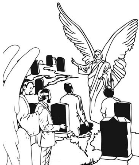
When Jesus returns, the angels will gather His people up to be with Him.

nation into His kingdom. And in John 14:1–3, Jesus' promise to return helps to quiet down the "troubled" hearts of His followers, to calm their nerves, and to give them hope.