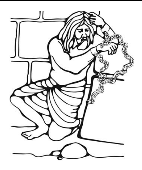
We are slaves to sin, sentenced to death, and only Jesus can free us.