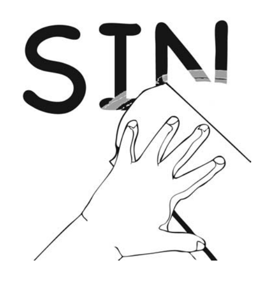
By way of Jesus' death, God "erases" our sin.

him in order to keep the god hilaros (happy, joyous) once more. New Testament authors have borrowed vocabulary from classical (very old) Greek and elsewhere and given that vocabulary new meaning.