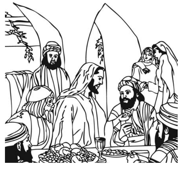
Jesus ate meals with people who were not accepted by others.

Imagine if this story were to take place today. We could imagine how Jesus would sit down with "lowerclass" people to share a meal. Eating and drinking are taking place. Loud music is heard. Practicing prostitutes are walking around in the shadows. That is the setting where Jesus went.