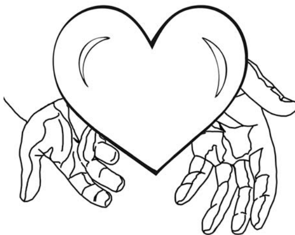
The Lord demands the whole heart.

said, we cannot “serve two masters” (Matthew 6:24).