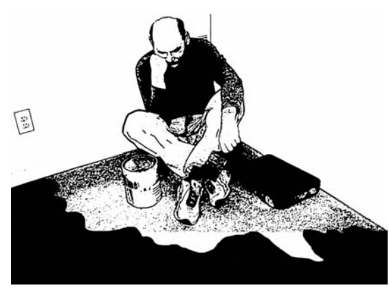
Sometimes our faith seems to paint us into a corner.

There is a phrase in English that says "to be painted into a corner." Just imagine you are painting the floor of a room. Then you suddenly notice that you have ended up in a corner and cannot get out. The only way out is by walking over the fresh paint or staying where you are until the paint dries!