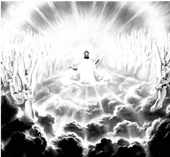
Jesus promised He would come again and take us to heaven.

Before leaving His disciples (followers), Jesus had promised them that His second coming would be sure. "If I go and do that [prepare a place in heaven] I will come back. And I will take you to be with me. Then you will also be where I am' " (John 14:3, NIV). Peter, one of Jesus' closest disciples, wrote, "But we are looking forward to a new heaven and a new earth. Godliness will make its home there. All of this is in keeping with God's promise" (2 Peter 3:13, NIV).