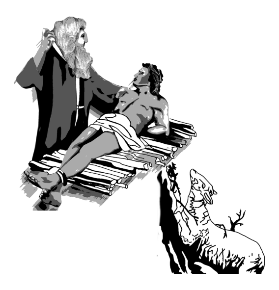
The difference between God's city and man's city is faith.

One reason for the struggle Christians face is how we relate to the government under which we live. We all live under a government that holds power. This government makes and enforces the rules and laws of our country. The Bible makes it clear that