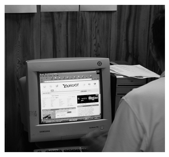
Are you always learning? Do you know the truth?

What lesson is here for us? What kind of knowledge are we looking for? What are we doing with that knowledge? What important lessons could this story have for each one of us? Also read 2 Timothy 3:7.