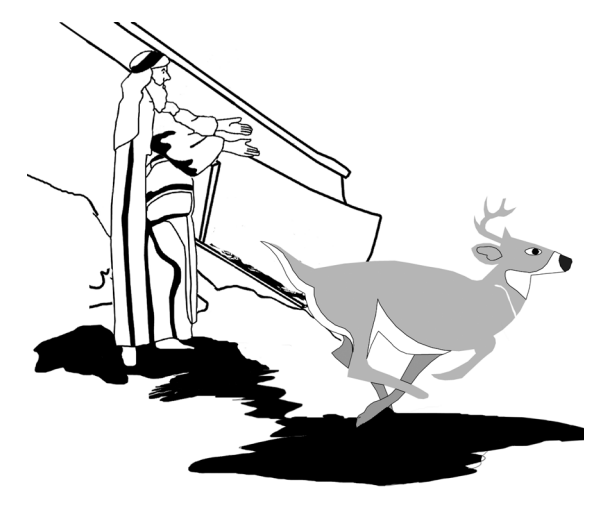
After the Flood, animals became afraid of people.

Contrast<sup>3</sup> Genesis 9:1-3 with God's words to Adam and Eve in Genesis 1:28-30. What is different between the two stories? Why are they different? What great change took place over people's relationship to animal life?