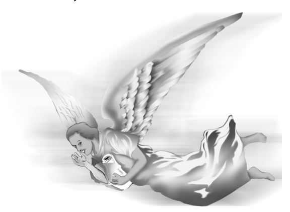
Worship God, our Creator! (See Rev. 14:6, 7.)

What is the common message in all of the following verses? Exodus 20:11; Job 38:4; John 1:1-3; Colossians 1:15-20; Hebrews 1:2; Revelation 14:6, 7.