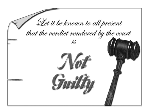
More good news!

12:2; Matthew 8:12; Matthew 25:46; John 3:18; 2 Thessalonians 1:9; Revelation 14:11.