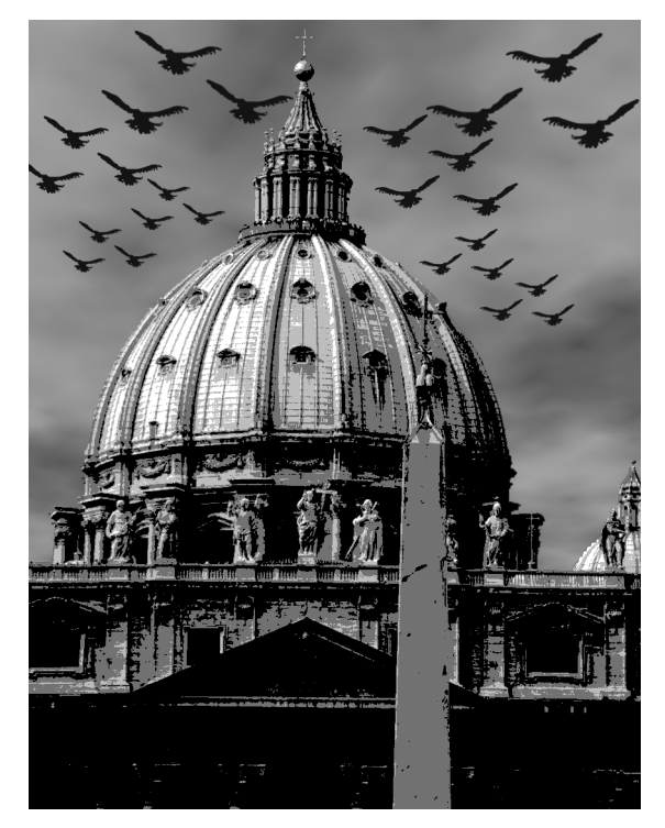
God's church calls all people to come out of Babylon and find salvation in Jesus.

Babylon that lead to the mark of the beast. Only Seventh-day Adventists are preaching the three angels' messages. However, we cannot preach these messages without a special outpouring of the Holy Spirit. So, we believe that in the end of earth's history the Holy Spirit will give gifts to the church in a wonderful way. That will be the latter rain.