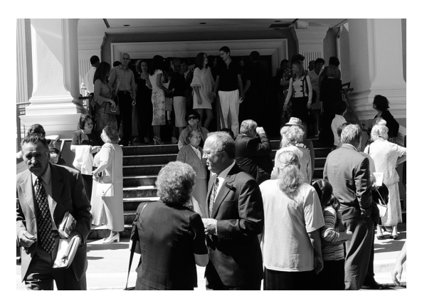
God can give us the Holy Spirit when we gather together.

"The holy gatherings of the church in camp meetings, in home church meetings, and in all soul-winning events are God's chosen opportunities for giving the early and the latter rain."—Adapted from Testimonies to Ministers and Gospel Workers , p. 508.