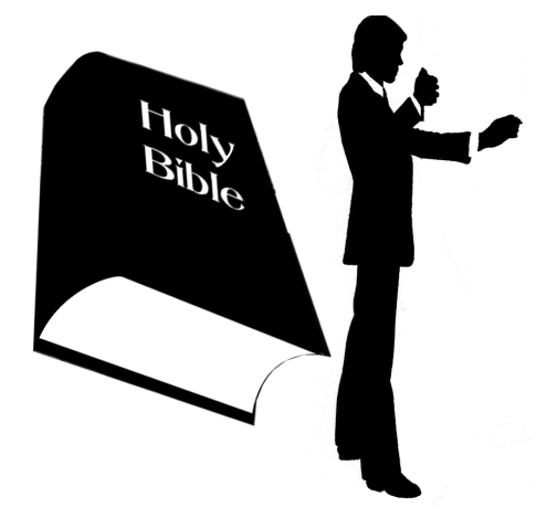
The sin against the Holy Spirit is stubborn refusal to accept Christ.

Putting one's self beyond the Holy Spirit's power cannot be forgiven. This is because we cannot even repent<sup>10</sup> without the Holy Spirit's help. However, He will never force us to do anything. We choose to accept His salvation or we choose to reject His salvation.