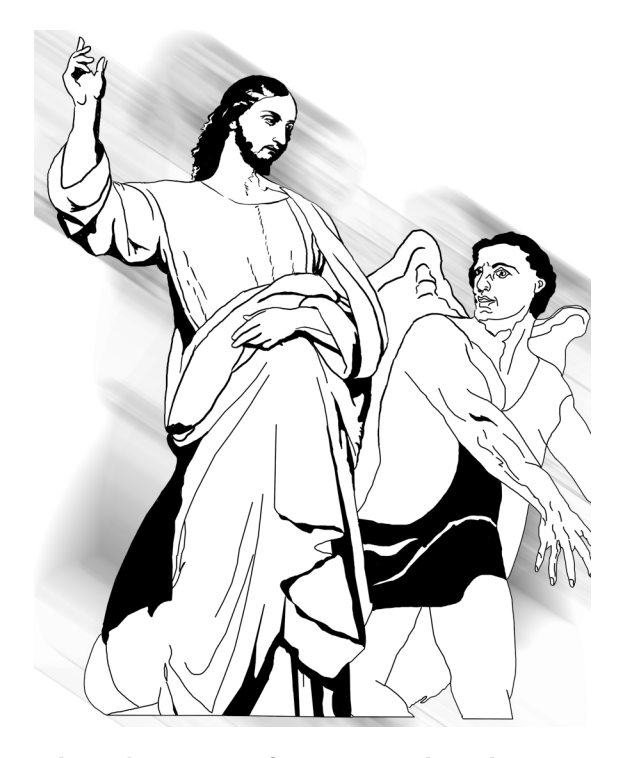
Jesus' success gives us another chance.

life, the promise of having everything restored that was lost through sin.