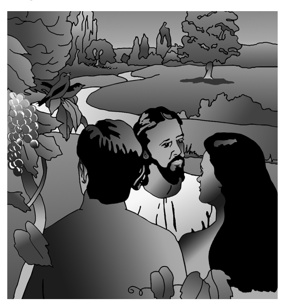
God put us here for a reason.

Genesis 1 shows that our life is no accident. We are not here because of something that just happened to cause this planet to be filled with people. We are here because God put us here on purpose. All of Genesis 1 shows God as the Creator. Genesis 1 shows that He had a clear plan for our life. He left nothing to chance. This is very different from evolution.3 Evolution teaches us that we are here only by chance. There was no plan nor purpose for us. We are just an accident. It is hard to imagine any view that is more opposed to the Bible than evolution. No wonder Satan works so hard to get people to believe in evolution.