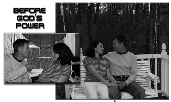
AFTER GOD'S POWER

Miracles can make our faith stronger. But faith that depends upon miracles is not real faith (Luke 16:31). Perhaps some of us have seen what could have been "miracles." But maybe for others, the greatest "miracle" is the change in their life brought about by God's power working in them. The Holy Spirit can do miracles (Matthew 12:28) whenever He chooses. But "miracles" are not proof that God is working. In the same way, the lack of "miracles" is not proof that God is not working.