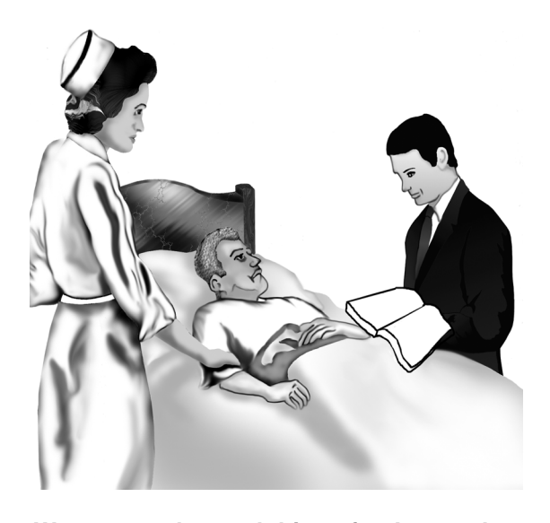
We want to do good things for Jesus when we are filled with the Holy Spirit.

How can we do some of the things Jesus did (John 14:12) if we are filled with the Holy Spirit? How have you been able to do some of these same things under the Holy Spirit's power?