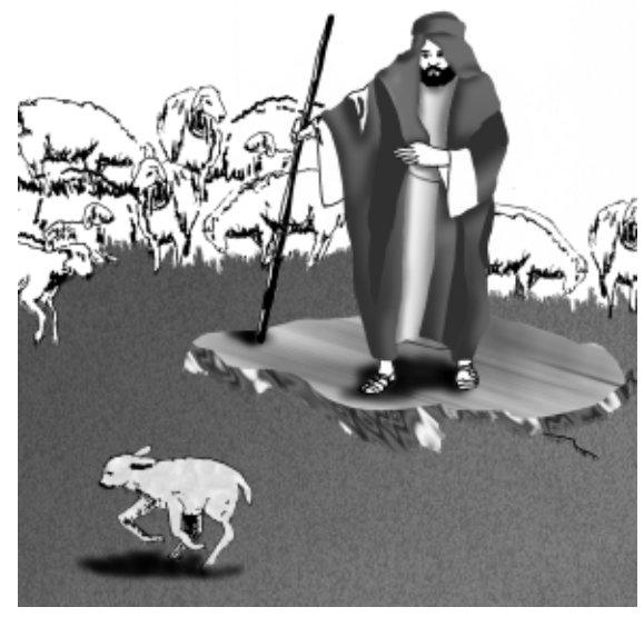
Gently guide your children the way a shepherd gently guides his sheep.

feeling of being loved by his or her parents is important if correction is to be redemptive (Proverbs 13:24).