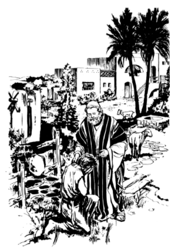
The prodigal son's father teaches us how to treat disobedient children.

How does God's attitude (feeling) toward those who refuse to accept Him help parents in dealing with rebellious children? God knows the pain of people refusing to accept Him. How does this bring comfort and encouragement to parents who worry about their disobedient children?