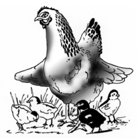
The Bible shows God as a mother hen who protects her children.

God speaks of Himself as the Husband of Israel. The New Testament also uses this symbol (Revelation 19:7). The Bible also shows God as a mother and a father. Read Isaiah 42:14 and Matthew 23:37.