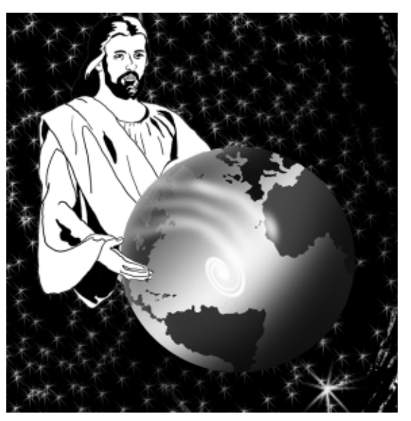
God made us. He also remakes us to be part of His church.

shows His wisdom to the universe (Ephesians 3:10).