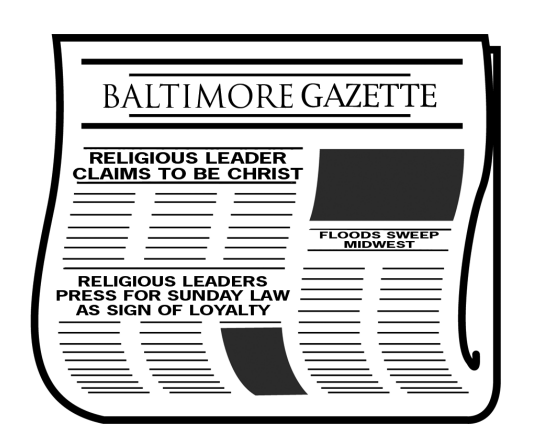
Remember that false christs will appear.