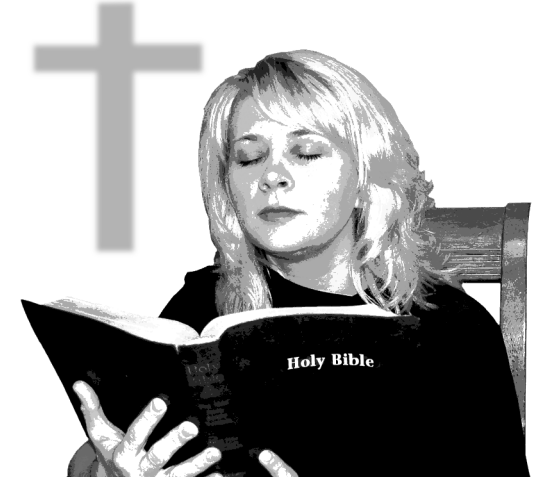
Sit under Jesus' shadow and think about Him.

"Keep your thoughts upon the Savior. Go apart from the busyness of the world and sit under Jesus' shadow. Then, among the noise of daily work and struggle, your strength will be renewed."—Adapted from Ellen G. White, In Heavenly Places , p. 62.