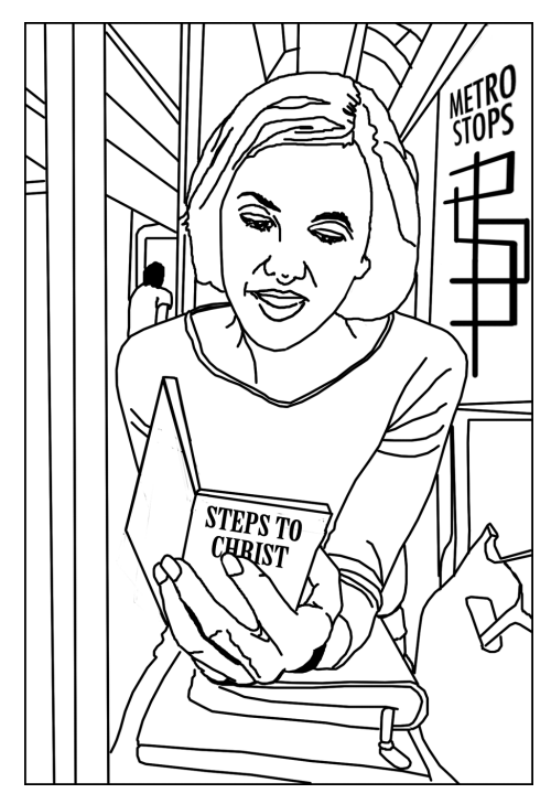
Focus on Jesus.

you read about Jesus, the more you will focus on holy things. The more you read about unholy things, the more you will think about unholy things.