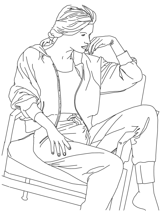
What are you thinking right now?

Imagine if your thoughts were suddenly put on a screen for everyone to read! What would be on that screen? What does this tell you about what is in your mind? What thoughts do you need to change? How can you change them?