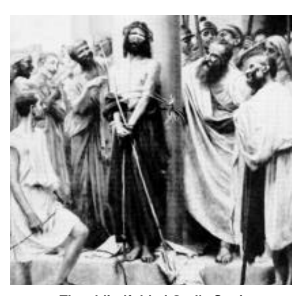
They blindfolded God's Son!