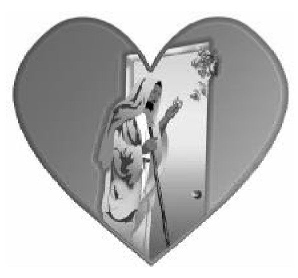
Jesus wants us to accept His invitations to choose Him.

more and more opportunities to repent. But if people continue to refuse God, they will become hard-hearted. God's many invitations lead to the hardening of their hearts. God really wants His invitations to soften people's hearts. His love toward us never changes. Our individual answer to God's love depends on what each one of us chooses.