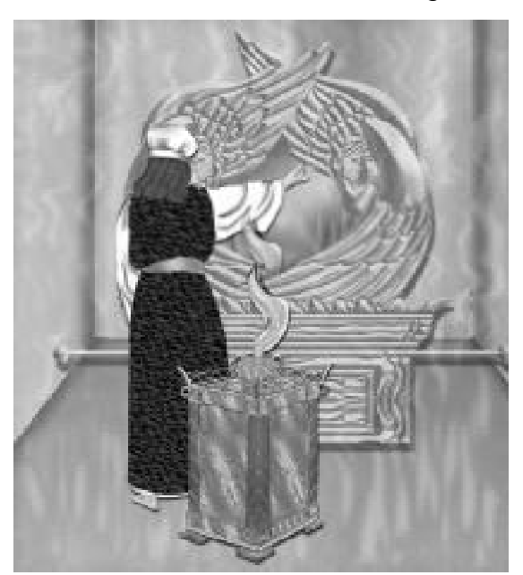
The High Priest in the Holy of Holies on the Day of Atonement.

Only the high priest could stand in front of God in the Holy of Holies<sup>11</sup> on the Day of Atonement.<sup>12</sup> He stood in front of a protective smokescreen of incense so he would not die (Leviticus 16:2, 12, 13). Isaiah saw God, even though he was not the high priest and he was not burning incense! The temple was filled with smoke (Isaiah 6:4). This reminds us of the cloud in which God's glory appeared on the Day of Atonement (Leviticus 16:2). Isaiah was so shocked, he thought he