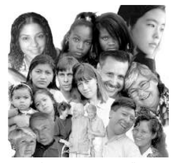
Jesus came to save us all.

"'Savior of the world'" means that salvation is not limited to race or geography. In Jesus, all kinds of peoples, including the hated Samaritans, can claim God's favor. For people who are hated and rejected, this kind of salvation comes as a great and welcome surprise. To people who claim to decide what is right and good, this salvation breaks down bar-