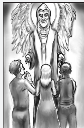
“Satan himself will pretend to be Jesus.”

“What will be Satan’s final act in his play of lies? Satan himself will pretend to be Jesus. The church has waited for Jesus to come for so long. Now Satan will make it look as if Jesus has really come. In different parts of the earth, Satan will appear as a bright and shining person. He will look the same as the picture of Jesus that John saw in his dream in Revelation. Revelation 1:13–15.”—Ellen G. White, The Great Controversy , page 624, adapted.