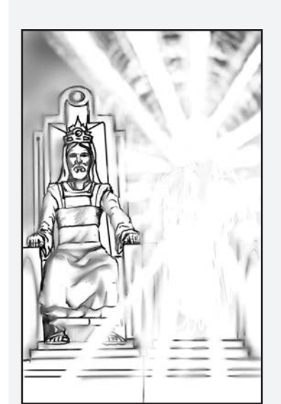
The place of honor at God's right side shows that Jesus is All-Powerful. He has control over all the earth (Psalm 110:1; Acts 7:55, 56).

Read Psalm 2; Psalm 110:5, 6; and Psalm 89:4, 13–17. What do these verses teach us about Jesus our King?