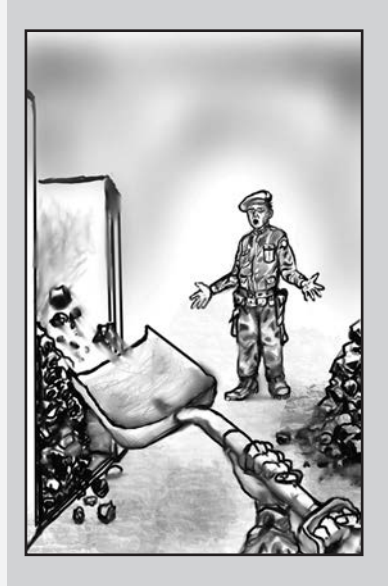
Everyone was surprised when Sekule shoveled enough coal by sunset.