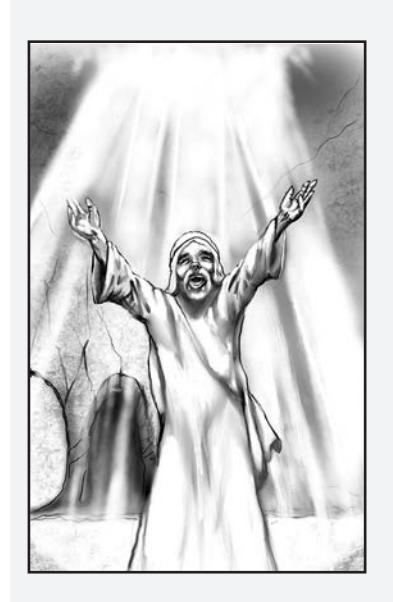
When Jesus woke up from the dead, God made Jesus the most powerful King over the whole earth (Acts 2:30, 31).

Read Colossians 1:16, 20–22. What do these verses teach us about Jesus? Who was He? What did He do for us?