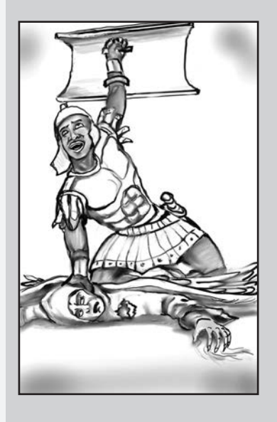
"I put on God's battle suit. I fought and won."