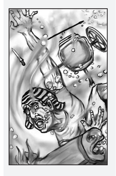
In everything that happened to Israel, good or bad, God was there. (Read Exodus 15.)

Why are the promises that God made to Israel also for us? What does Jesus give us that helps us answer the question? Hint: read Galatians 3:26–29.