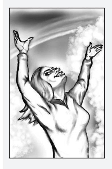
The beauty of the skies shows us that our God is very powerful (Psalm 19:1–4; Psalm 97:6).

"But why is man important to you? Why do you take care of human beings?" (Psalm 8:4, ICB). What does this verse teach you about God's love? The Bible says that God "counts the stars and names each one" (Psalm 147:4, ICB). How much more do you think God cares for you than the stars?