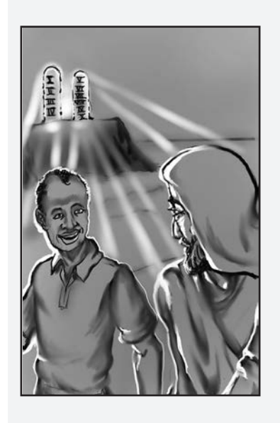
God's law teaches His people how to live so that they will not be afraid or lost when He judges them.

How does keeping God's laws and following His teachings make your life better? Did you suffer when you broke God's laws and didn't follow His teachings?