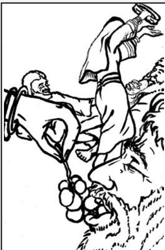
The men of Israel lost their good sense and self-control.

ADDITIONAL THOUGHT: “The war between good and evil started in heaven. Satan has been hard at work on this plan since he decided to disobey God. Satan went to war against God to get rid of His law. God threw Satan out of heaven. But Satan continued his war against God on this earth. Satan has been very busy. He tricks men with his lies. Then Satan leads them to break the law of God. Satan leads some men to throw out one of the commandments. Satan leads other men to throw out the whole law. In the end, the same thing happens. The person that is guilty of breaking one law shows he does not respect the whole law. This man will, by his example, lead other people to sin. In this way, this man becomes guilty of breaking the whole law. James 2:10.” —Ellen G. White, The Great Controversy , page 582, adapted.