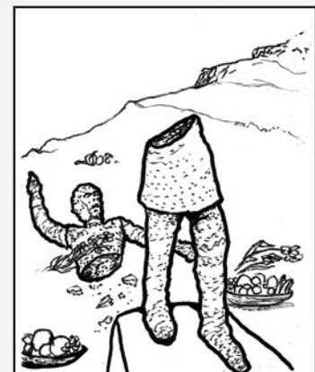
“All” the people who followed Baal at Peor were destroyed.

How do prayer, Bible study, worship, and fellowship help us “[stay] with the LORD” (Deuteronomy 4:4, ERV)?