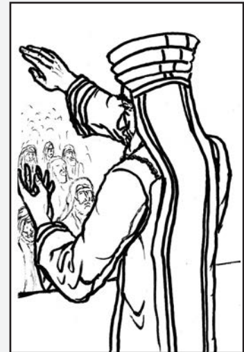
God chose His people to be a kingdom of religious leaders and princes.

Read Matthew 5:13–16. What is Jesus saying to us in these verses? How does this message show the same thing Jesus said to Israel in the Old Testament? What does this message mean to us today, as Seventh-day Adventists?