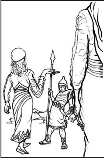
Satan sends Midianite women to the men of Israel.

Read Numbers 25:1–15. What happened in this story? What Bible truth and important lessons should the people of Israel learn from this awful experience?