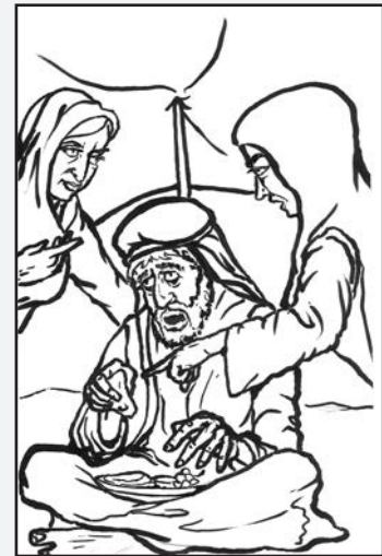
Leah and Rachel are sisters. They fight against each other for Jacob.

Read part of the list of heroes of faith in Hebrews 11:17–22. Do you see that Abraham, Isaac, and Jacob are in this list of Bible heroes? Think about all their family problems. These men made a lot of mistakes, right? So, why do you think Paul includes these men in his list of faith heroes in Hebrews 11?