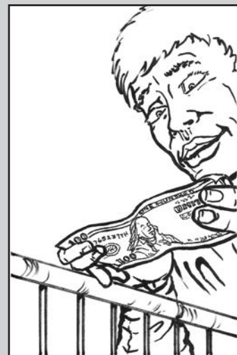
Roman looked down into the cart. A $100 bill lay in the cart!