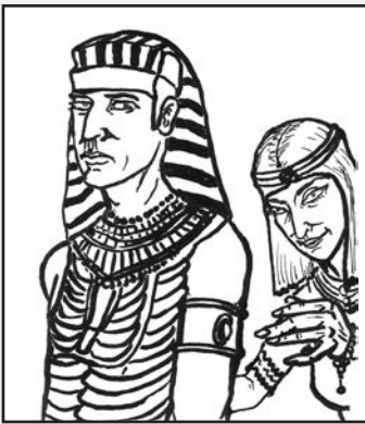
The wife of Potiphar wants to “use” Joseph.

Joseph understands that he cannot control the behavior of other people. He decides to live, love, and trust the people around him in a way that honors God. Joseph has learned to live as if God is with him every second. This knowledge helps Joseph say no to sin.