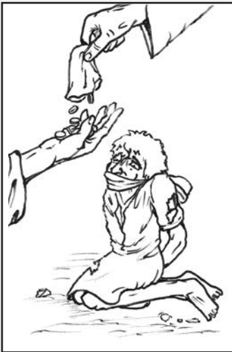
The brothers sell Joseph to some slave traders who travel by.

MEMORY VERSE: “Dear friends, you already know about this. So be careful. Don’t let these evil people lead you away by the wrong they do. Be careful that you do not fall from your strong faith. But grow in the grace [loving-favor] and knowledge of our Lord and Savior Jesus Christ. Glory be to him, now and forever! Amen” (2 Peter 3:17, 18, ERV).