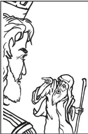
God sends Nathan to David. Nathan is a prophet.

First, David sleeps with the wife of one of his most loyal soldiers. Then David tries to hide his sin. David orders Joab to kill Uriah by putting him where the enemy can shoot Uriah in war. These sins show us one of the worst times in the life of King David. But there is good news. God sends Nathan to David. Nathan is a prophet. A prophet is a special messenger from God. Nathan and David are friends. Earlier, Nathan gives David advice about his plans to build God a temple (2 Samuel 7). Now, God gives Nathan a different job to do for the guilty king.