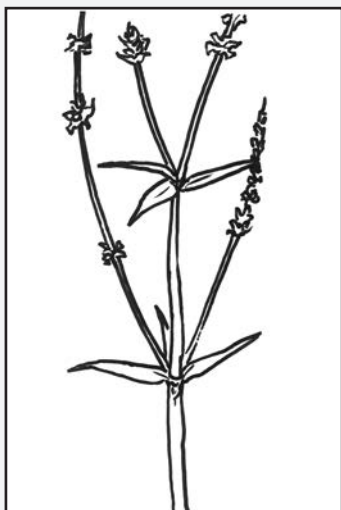
Hyssop is used in the law of Moses to make a person clean.

Next, David asks God for joy. Are you surprised that David asks for joy after all the awful things he does? Verse 13 of Psalm 51 helps us understand why David asks for joy: “Then I will teach your ways to those [people] who do wrong. And sinners will turn back to you” (Psalm 51:13, ICB).