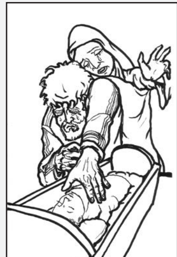
The child of David and Bathsheba will die soon after he is born.

This psalm helps us understand how much our rest in Jesus costs. First, we must understand that, as sinners, we need help. We need a Savior. We see our sins. Then we pray to the only One who can wash us and make us clean. The Savior is the only One who can make us new. When we pray to Him for help, we will find courage. If you ever feel you sinned too much for God to take you back, remember David. David sleeps with a married woman. David lies. He kills. He breaks at least five of the Ten Commandments. If David can pray to God for help and forgiveness, then we can, too.