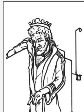
David looks out over the city and sees a very beautiful woman.

David comes up with a very tricky plan to get Uriah home to sleep with his wife. This way, everyone will think Uriah is the father of the child of Bathsheba. But the plan of David fails. Uriah is loyal to God. Uriah refuses to visit his wife. He tells David, “ ‘The Holy Box [the ark] and the soldiers of Israel and Judah are staying in tents. My lord Joab and my lord’s officers are camping out in the field. So it is not right for me to go home to eat and drink and sleep with my wife’ ” (2 Samuel 11:11, ERV). When the tricky plan does not work, David decides to use force. He orders for Uriah to be killed in war.