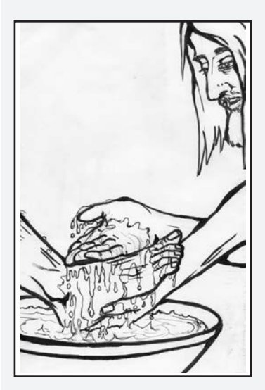
The heart of Jesus is empty of all pride.