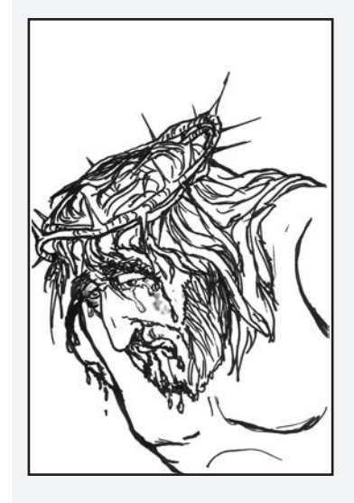
The Servant suffers so much that no one who sees His face knows who He is anymore.

Look carefully at Isaiah 53:6. What is the message for us in this verse? What is this verse saying to you personally? You may have sinned or failed to do the right thing in the past. How does this verse give you hope?