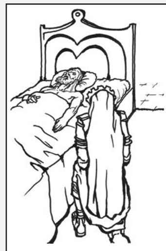
King Ahaz dies. Then his son Hezekiah becomes king.

Hezekiah also was a strong spiritual leader at this time. He helped his people to have courage at this awful time. “King Hezekiah makes up his mind to do his part. He will do everything he can to get ready to fight against the enemy. After he does all that he can do, the king calls his army together. Then he tells them to have courage.”—Ellen G. White, Prophets and Kings , page 351, adapted.