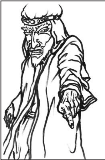
The rabshakeh tells Judah to give up now. A rabshakeh is a high officer.

What lies does the rabshakeh use to make the people of Judah afraid? For the answer, read Isaiah 36:2–20; read also 2 Kings 18:17–35 and 2 Chronicles 32:9–19.