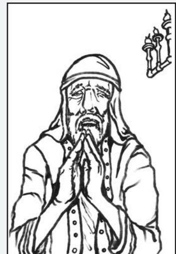
Hezekiah turns to God. He asks God to show Sennacherib who He is.

Sennacherib attacks the faith of Hezekiah. Faith in God makes Hezekiah strong. But does Hezekiah lose courage? No. He turns to God. He asks God to show Sennacherib who He is. “ ‘So please save us from the king of Assyria. Then all the other nations [countries] will know that you are the LORD, the only God’ ” (Isaiah 37:20, ERV).