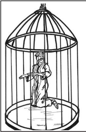
Sennacherib brags that he made Hezekiah the Jew a prisoner.

Assyrian records show that Sennacherib took 46 cities. His army attacked Jerusalem. Sennacherib brags that he made Hezekiah the Jew “a prisoner in Jerusalem in his royal palace. I made Hezekiah the same as a bird in a cage.” —James B. Pritchard, editor, Ancient Near Eastern Texts Relating to the Old Testament (Princeton, NJ: Princeton University Press, 1969), page 288, adapted. But none of the records of Sennacherib or the carved pictures in his palace show that he took Jerusalem. Sennacherib was a mighty king. People who fought against his power did not live very long. They died very awful deaths. But Hezekiah led countries to fight against him. And Sennacherib did not kill him or take his city.