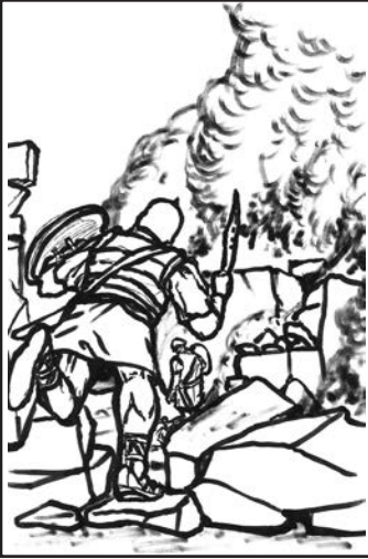
Isaiah 13 talks about the end of Babylon.

In 626 B.C., Nabopolassar of Chaldea made Babylon a powerful city. He made himself king in Babylon. He also fought with the kingdom of Media against Assyria. Together, Babylon and Media beat Assyria in war. The son of Nabopolassar was Nebuchadnezzar the Second. Nebuchadnezzar beat Judah. Then he took the people of Judah as his prisoners. He carried them away to Babylon.