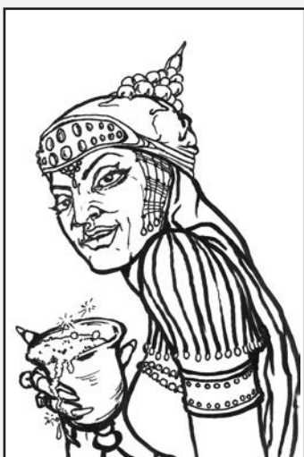
In Revelation, Babylon is shown as a woman.

Later, the Bible uses the name “Babylon” for Rome (1 Peter 5:13). The Bible also uses “Babylon” as a word picture for an evil power in Revelation 14:8; Revelation 16:19; Revelation 17:5; and Revelation 18:2, 10, 21. Why?